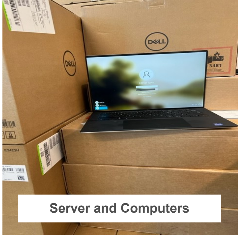
Server and Computers