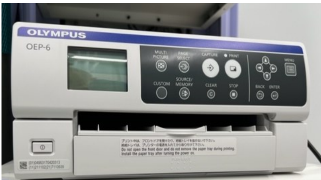
Patient Monitor & Printer